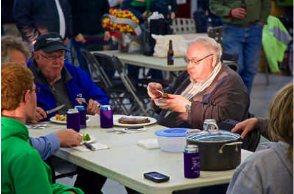
It all began so innocently