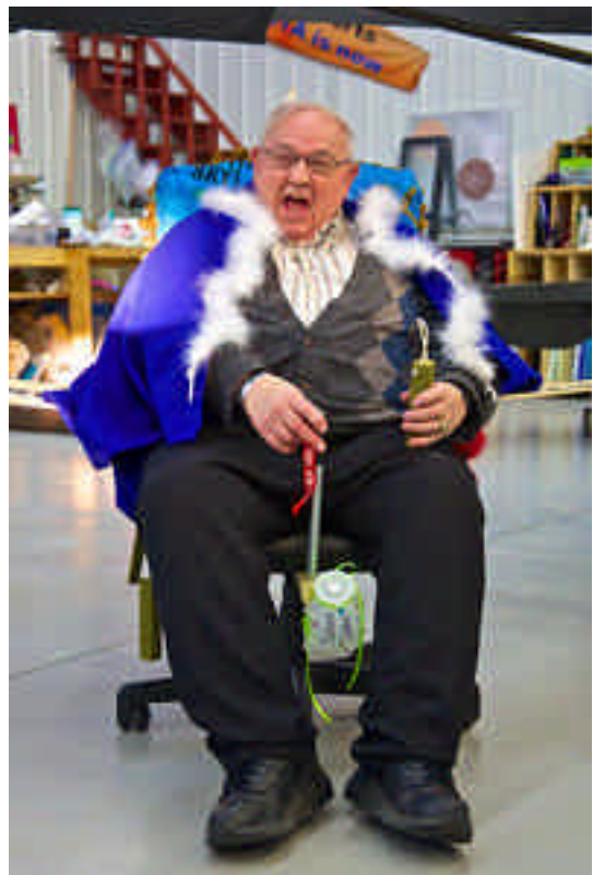
He finally made it